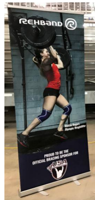
Pull Up Sign