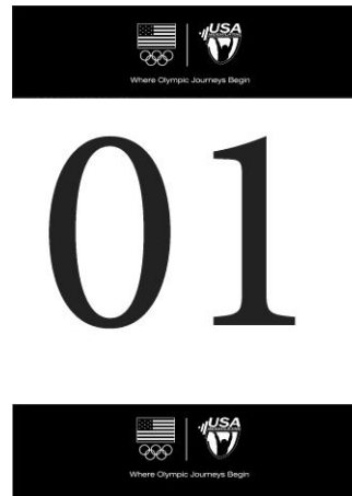
Warm Up Pass