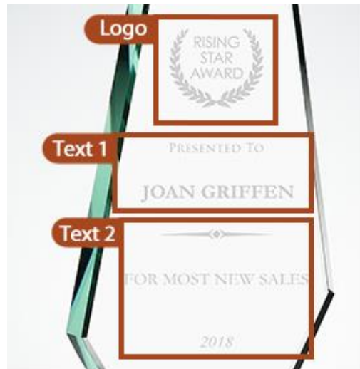
Standard Artwork Template

Jade glass, light green pigmentation. With custom artwork $100.