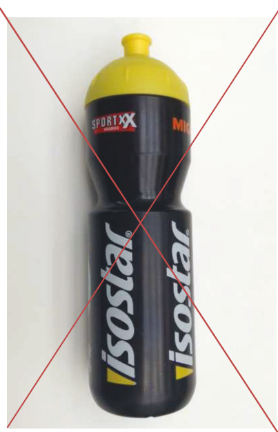
Non-compliant water bottle