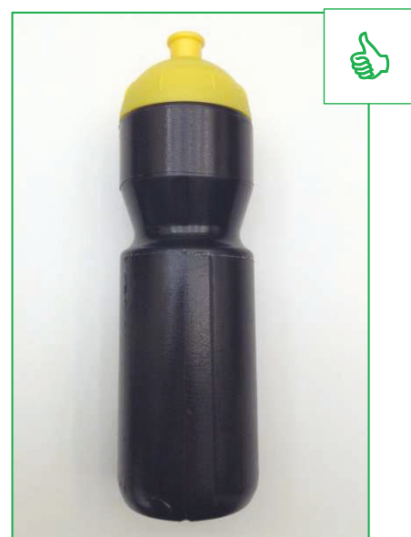
compliant water bottle