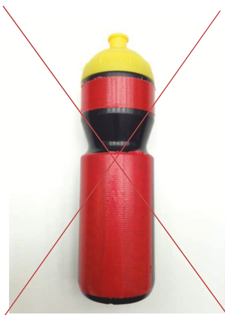
Not “tone-on-tone” taping