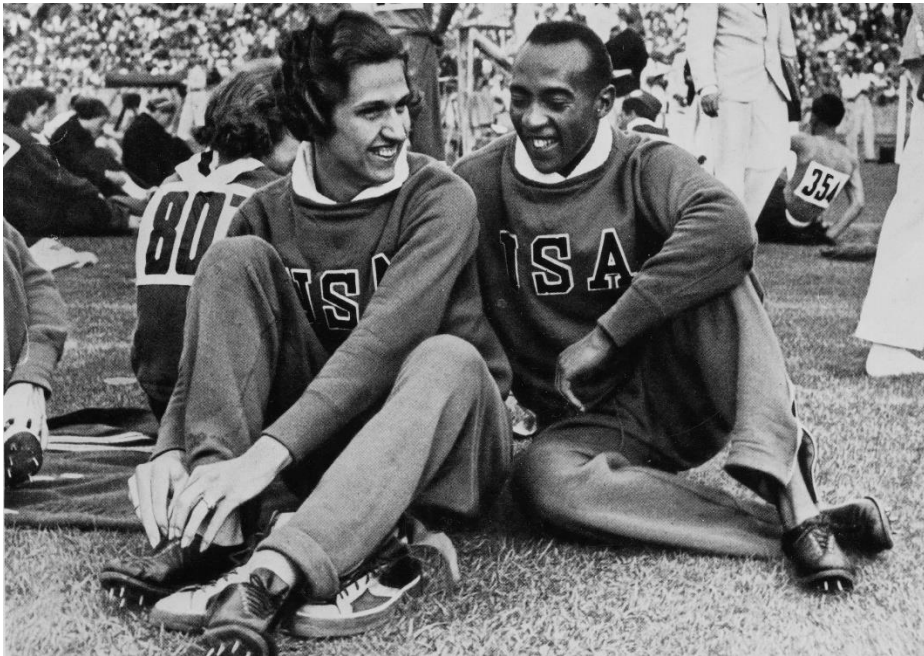
Helens Stephens and Jesse Owens, 1936 Olympic Games