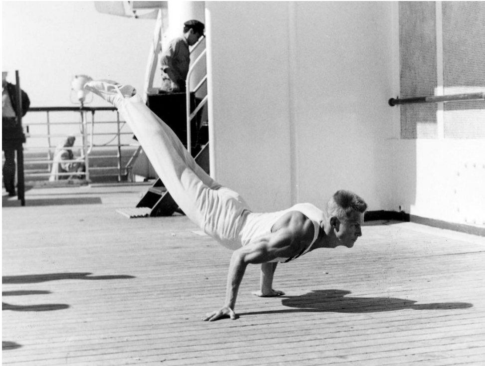
William Bonsall, 1948 Olympic Games